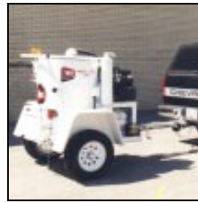
TRAILER MOUNTED SYSTEM

Built-in conveniences like integrated suction tube and hose storage, "bolt-on-trailer" package, easy access/easy maintenance filtration system and the economy of one man operation, makes the TLV 300 a versatile and cost effective vacuum system.