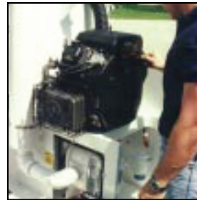
20 HP GAS ENGINE