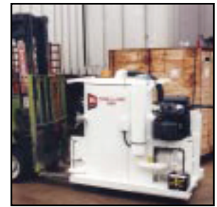
SKID MOUNTED SYSTEM