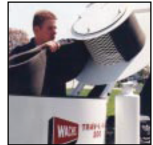
EASY ACCESS FILTER SYSTEM